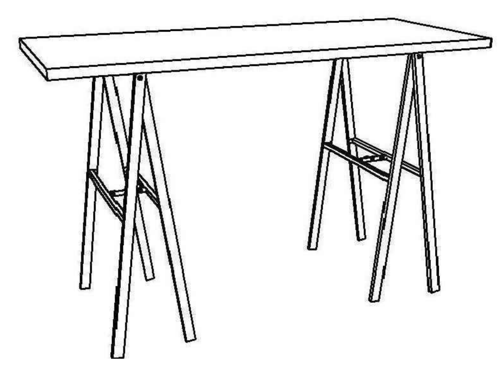
THANK YOU FOR YOUR PURCHASE!